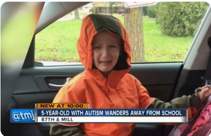
5-Year-Old Boy with Autism Left School and Nobody Noticed

A few school elopement incidents that gained media attention: