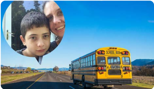
Boys with autism dropped off at the wrong school, located with AngelSense

Schools can monitor the arrival of the school bus and know exactly when to wait for the child by using the ETA and traffic information features.